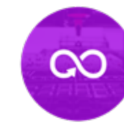
Production and consumption

Keynotes, round tables and entrepreneurial pitches followed one another during this action-oriented Forum - a sharing of opinions and solutions towards a low-carbon future.