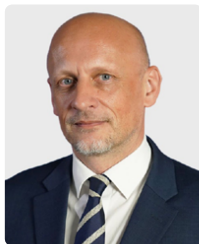
TIME FOR TRANSITION WRITTEN INTERVIEW WITH IEA CHIEF ENERGY ECONOMIST TIM GOULD

But by 2050, almost half the reductions come from technologies that are currently